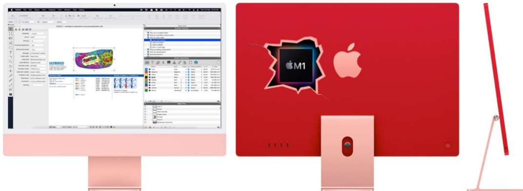
PACKZ 7 runs natively on Apple M1 and the newest Mac computers

PACKZ 7's fully ICC compliant color management is now powered by ColorLogic. The combination of ColorLogic's unparalleled range of spectral color technology combined with HYBRID Software's high level of automation and integration possibilities, brings supreme color matching for any printing technology in PACKZ and the workflows.